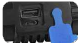
USB + Micro USB Ports and Input + output