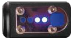
Battery status indicator