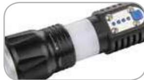
Pull up flood/camping lantern