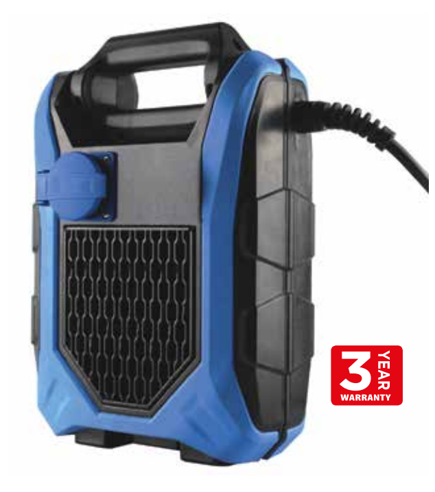
1 x 240V sockets outlets , 13Amp, BS plug Connect tools or link lights together

The Galaxy work light range, allows you to connect with other lights and power tools. The light has a robust housing to protect the dual LED lights when being transported or stored. The Galaxy work light easily folds out to a floor standing A-frame, giving multi-directional light and can be tripod mounted.