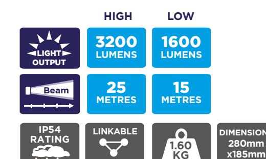
PRODUCT CODE: NSGALAXYAC3200