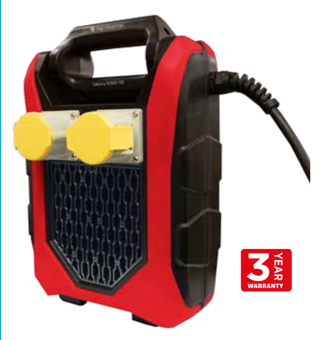
2 x 110V CEE sockets outlets, 16Amp, 110V plug Connect tools or link lights together