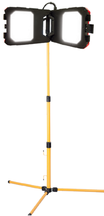
Optional tripod available SPTRIP01.7