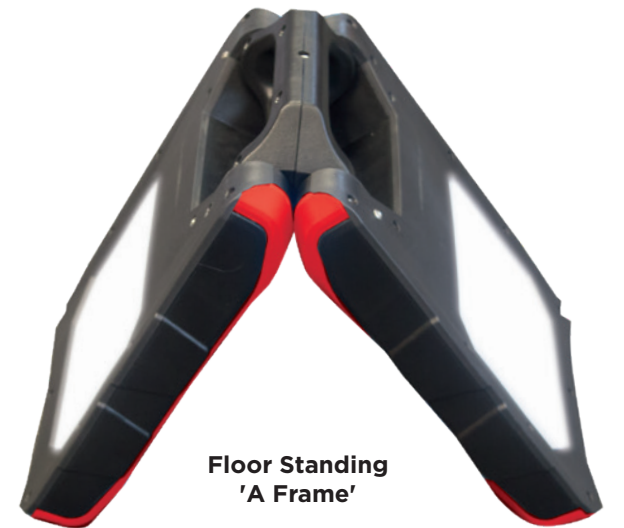
Floor Standing 'A Frame'