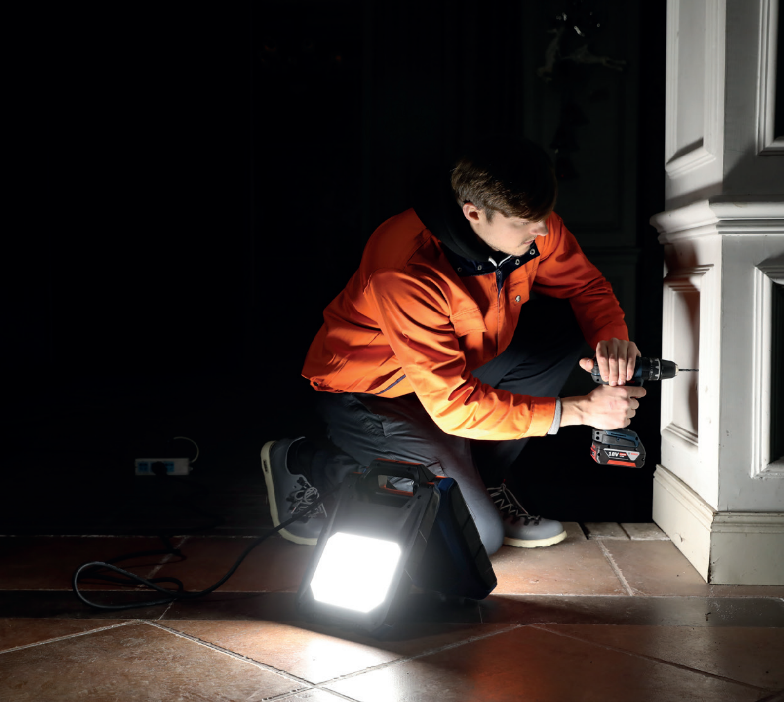
Two Light Modes: