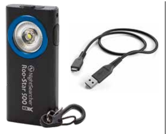
Supplied with: Fast charging type C USB cable